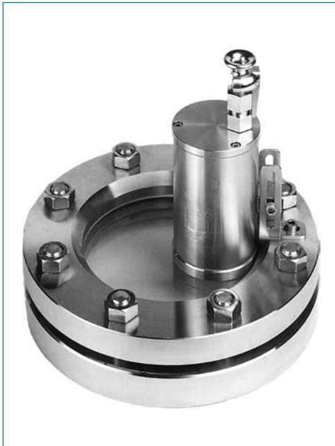
Sightglass light fitting type EdelEx 20 dH Sch K1, 20 W, 24 V, Ex d IIC T4 Gb, Ex t IIIC T130°C Db IP67, Ex II 2 G + D, mounted onto circular sightglass to DIN 28120, PN 10, DN 125.