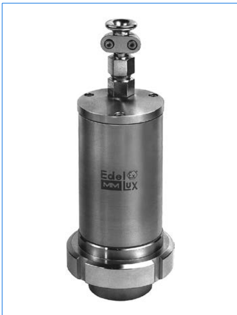
Sightglass light fitting type EdelEx 10 dH R50 K1, 10 W, 230 V, Ex d IIC T4 Gb, Ex t IIIC T130°C Db IP67, Ex II 2 G + D, with intermediate flange collar fixation "R", mounted onto a screwed sightglass similar to DIN 11851, PN 6, DN 50.

With the series EdelEx, MAX MÜLLER AG presents the first hazardous area sight-glass light fitting made of stainless steel . With the combination of advanced technological ideas, no compromise design and the reputed MAX MÜLLER quality, the series EdelEx offers to the fabricators and users of all stainless steel process equipment the following important advantages: