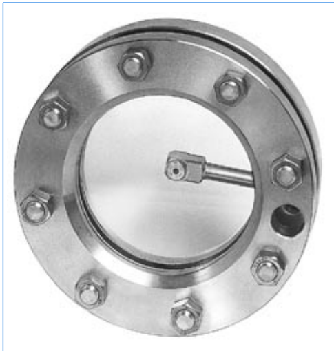
Spraying unit, type SV 4, built into circular sightglass similar to DIN 28120, DN 125, PN 6.