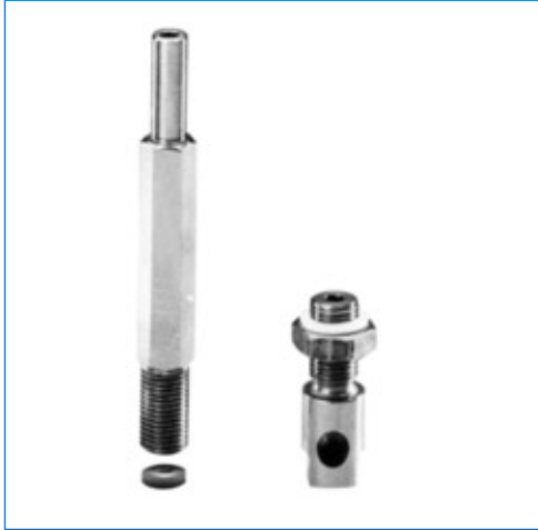
Spraying unit of the series SVS