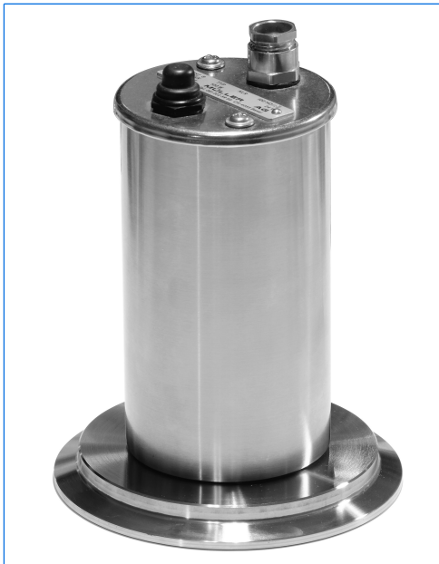
Sightglass light fitting type KLR 20 HDAsp, 20 W, 115 V, with built-in momentary push-button "D", on metal fused sightglass for Triclamp fittings, DN 100