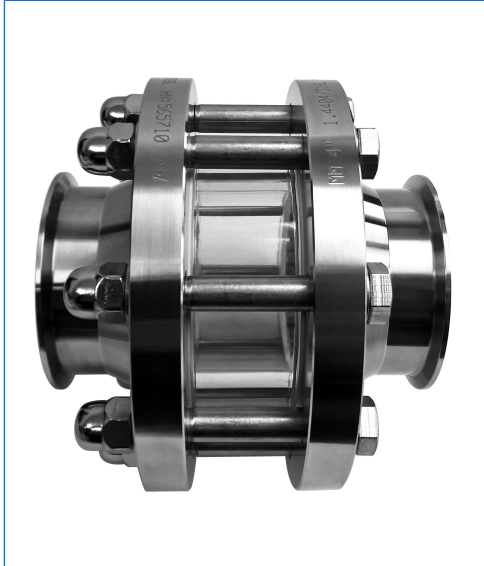
Sight flow indicator, series DSP, with TriClamp® connections, 4", on both sides