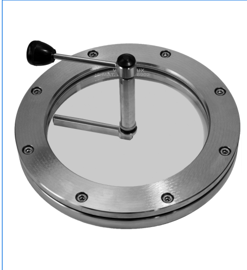
Circular sightglass, DN 150, PN 0, with glass disc in sodium silicate to DIN 8902 and wiper of the series W, wiper blade in silicone