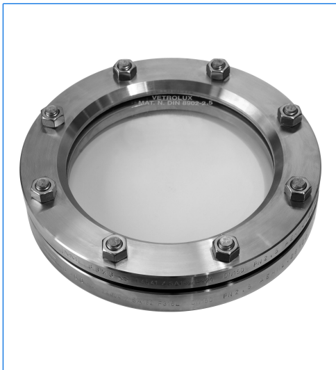
Circular sightglass similar to DIN 28120, DN 150, PN 2,5, with glass disc in sodium silicate to DIN 8902