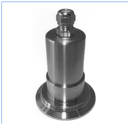
Micro LED light fitting, type MVLR 2 LED, 2 W, 24 V AC/DC, mounted on metal fused sightglass for Triclamp® fitting, DN 50, PN 16

Series MVLR in stainless steel for use in safe areas