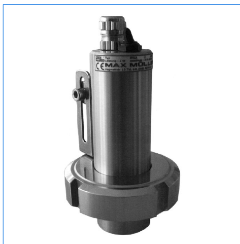
Micro LED light fitting, MVLR 2 LED E Sch1, 2 W, 24 V AC/DC, with integrated ON-OFF switch "E", mounted on VETROLUX screwed sightglass similar to DIN 11851, DN 32, PN 6